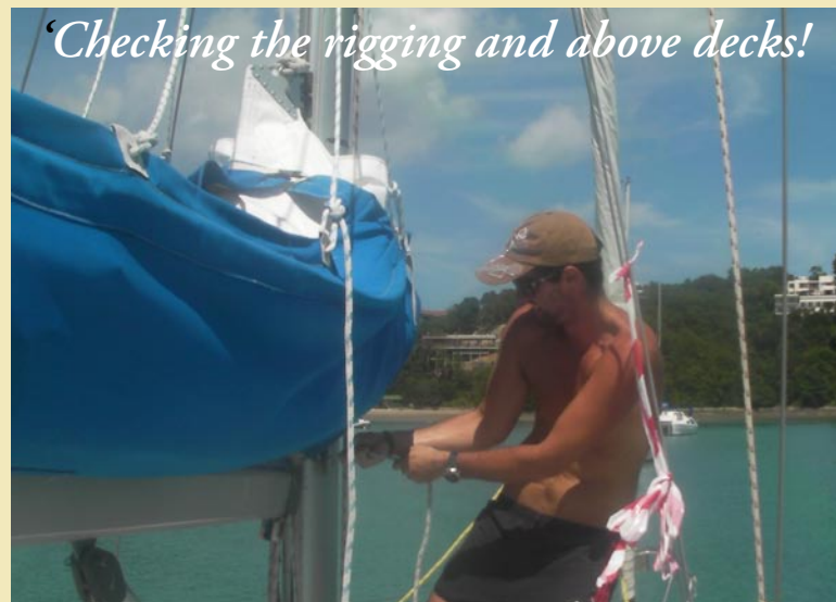
Checking the rigging and above decks!