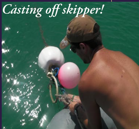
Casting off skipper!